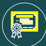
CERTIFICATES I - IV