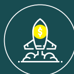
STARTING YOUR OWN BUSINESS