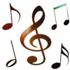
Music Supporters' Group