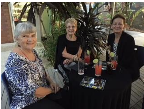
Three of our many wonderful Homestay providers enjoying a chat together over some colourful, exotic mocktails.

The majority of the International Students at SPS are here without their families and the School's Homestay providers fill this gap by offering more than just board and lodging. Homestay is a home-away-from-home! Not only do Homestay providers open their homes to our overseas students but also welcome them into their families, providing a warm and friendly environment to help the students settle into all aspects of their new life in Australia.