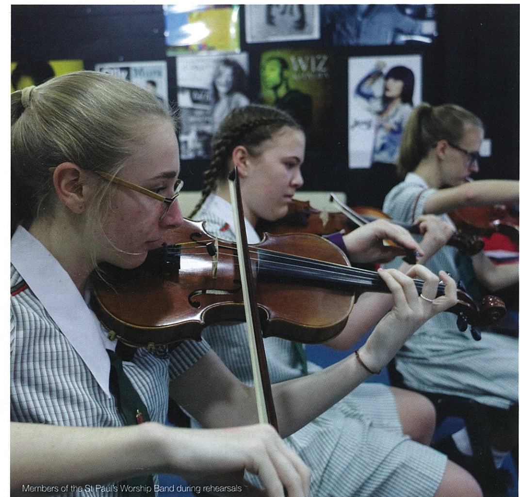
Members of the St Paul's Worship Band during rehearsals

"I enjoy being part of the School worship band as it's full of friendly people, many of whom I'm friends with, and it's a wonderful chance to be part of a music team in a Christian context."